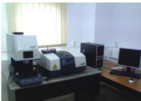
FT-IR Spectrometer and IR Microscope