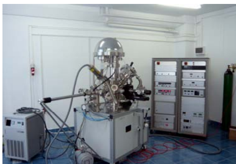
XPS and UPS Spectrometer