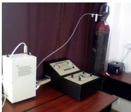
Critical point drayer